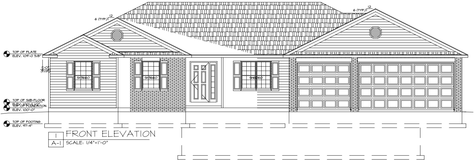
FRONT ELEVATION A-1 SCALE: 1/4"=1'-0"